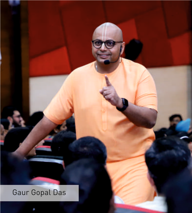
Gaur Gopal Das

At Chitkara University, learning extends beyond classrooms. Our students have countless opportunities to engage with celebrated artists, industry leaders, innovators, and changemakers who share their experiences and perspectives with them. These interactions bring knowledge to life, deepen understanding, and make education engaging, memorable, and help in preparing confident, curious, and future-ready individuals.