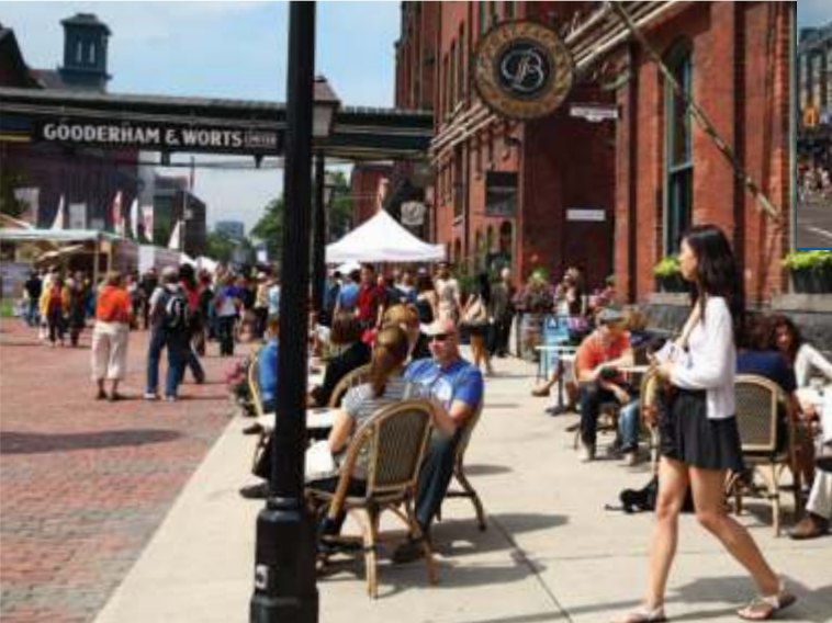
Distillery District of Toronto

World-class public transportation makes it easy to get around and discover Toronto's many attractions and vibrant neighbourhoods. There are lots of exciting options for entertainment, dining, music and theatre, art galleries and museums, professional sports as well as parks and beaches. Outside of Toronto, you'll find a large selection of recreational sites and activities, including vast wilderness areas. Hiking, biking, camping, kayaking, downhill skiing and attractions like the Niagara Falls, are all within easy access from downtown.