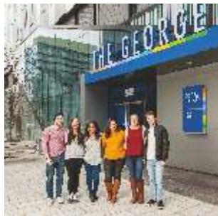
The George Student Residence

GBC is committed to making sure our international students have what they need to succeed and make the most of their experience in Canada.