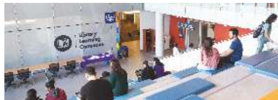
Library Learning Commons