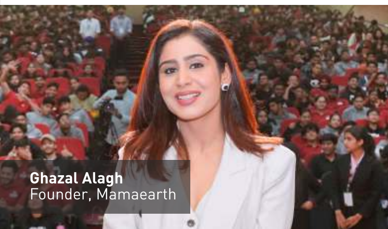
Ghazal Alagh Founder, Mamaearth