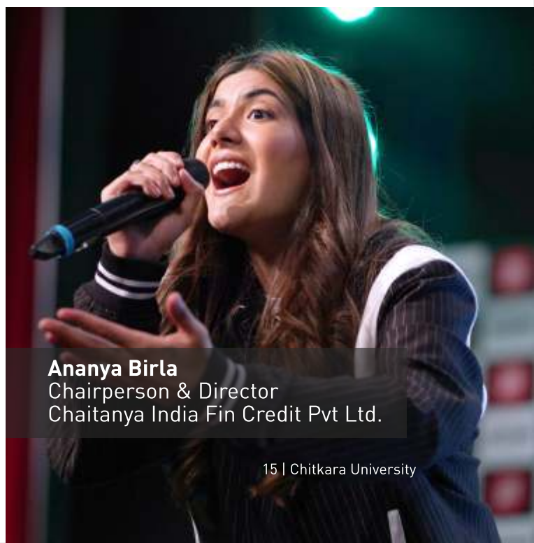
Ananya Birla Chairperson & Director Chaitanya India Fin Credit Pvt Ltd.