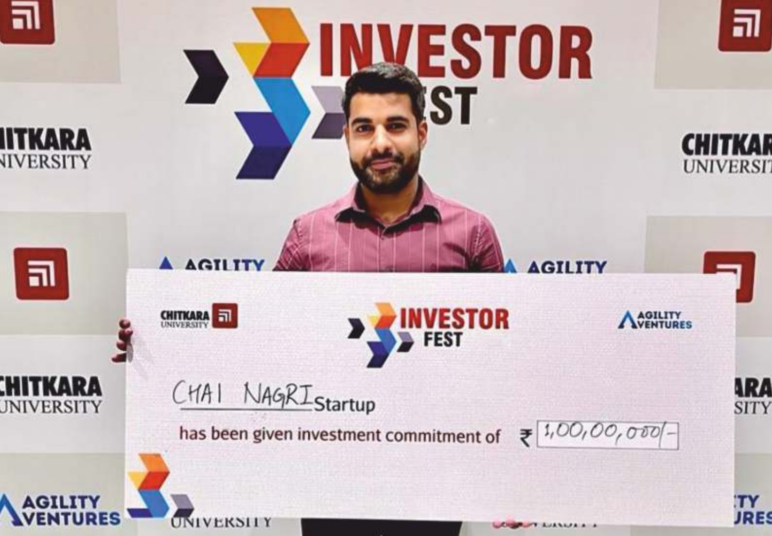
Chitkara University incubated startup "Chai Nagri" raises $122k at Investor Fest