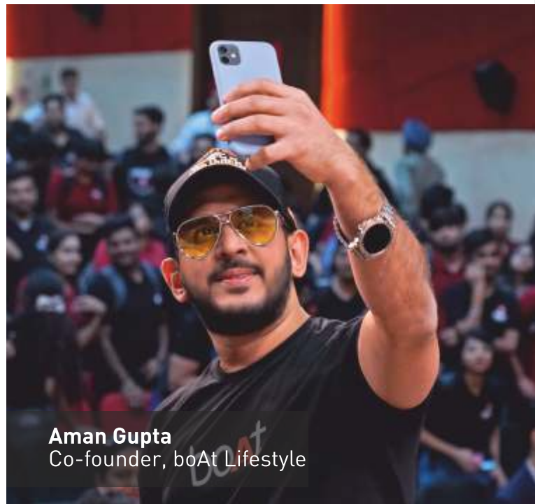
Aman Gupta Co-founder, boAt Lifestyle