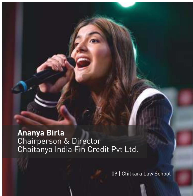
Ananya Birla Chairperson & Director Chaitanya India Fin Credit Pvt Ltd.