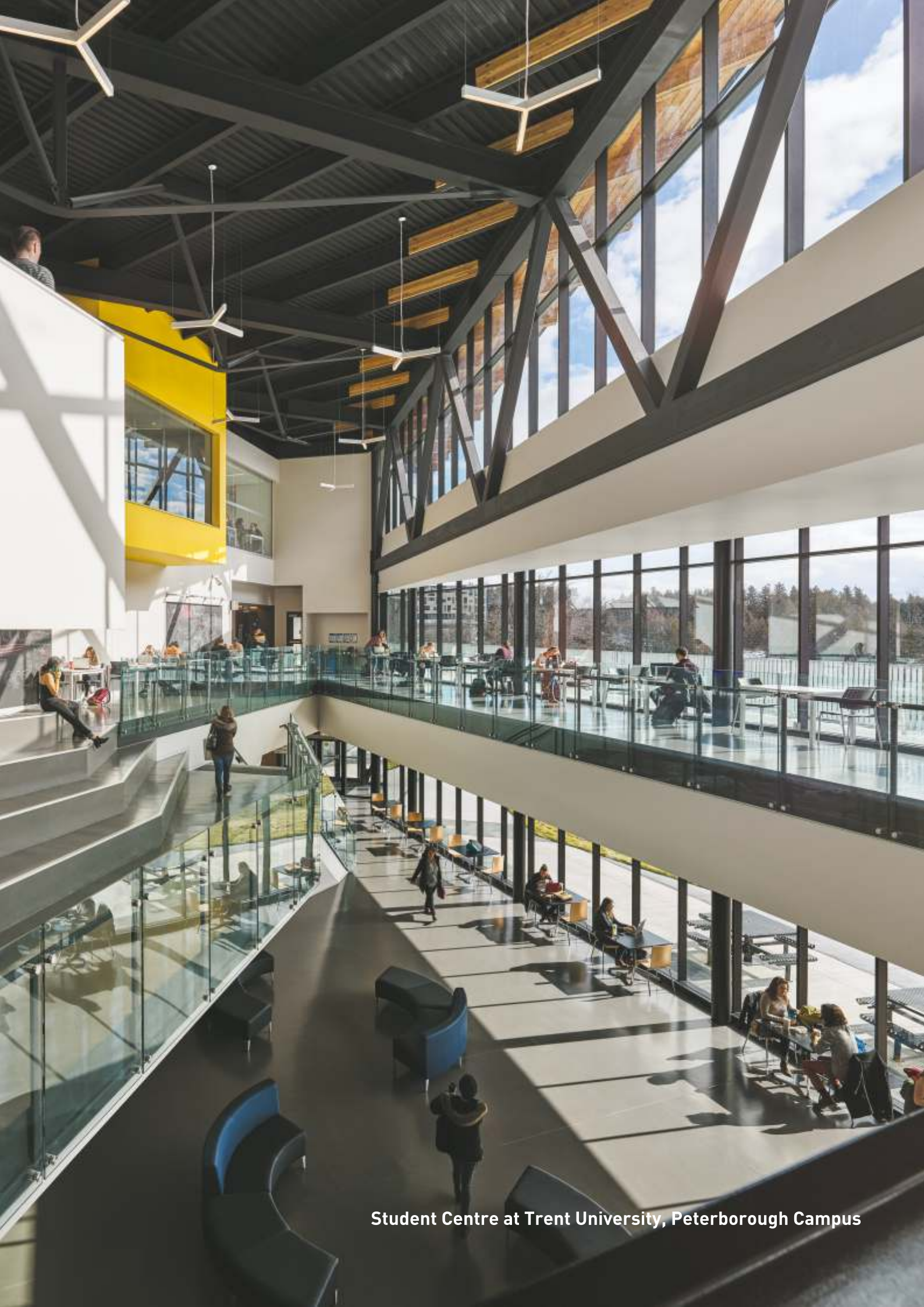
Student Centre at Trent University, Peterborough Campus