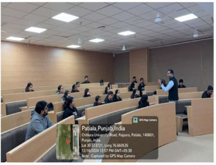
Resource person handling students queries