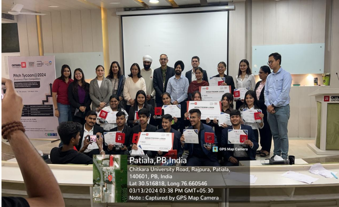
Winners of the Pitchtycoon @2024 with Jury and Faculty , 13-03-2024