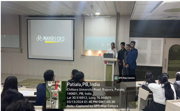
Student Team presenting their Idea, 13-03-2024