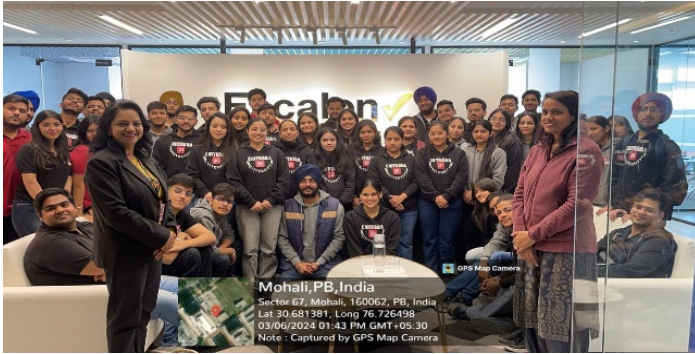
Students at Escalon