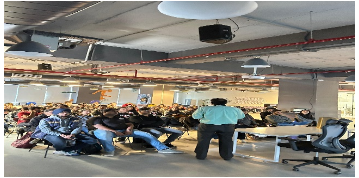
Students attending a presentation at Escalon