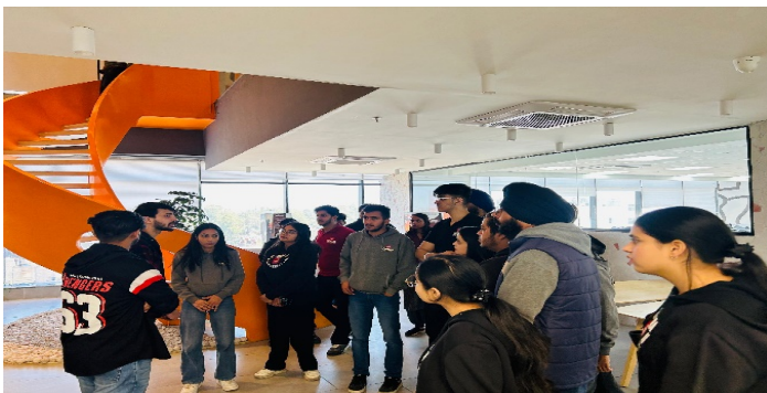
Students interacting with officials of Escalon