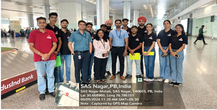
Aviation Students with Airport Manager and Faculty (05-09-2024)