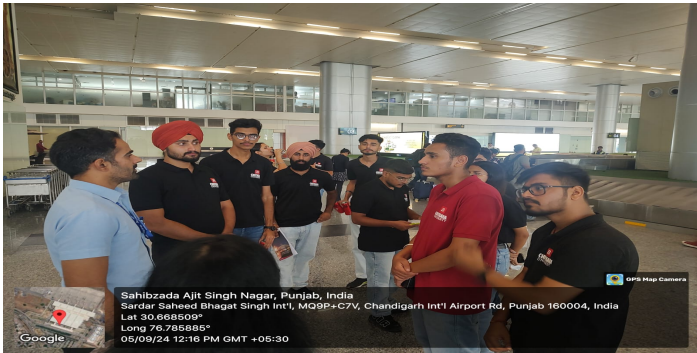
Students in discussion with Authorities (06-09-2024)