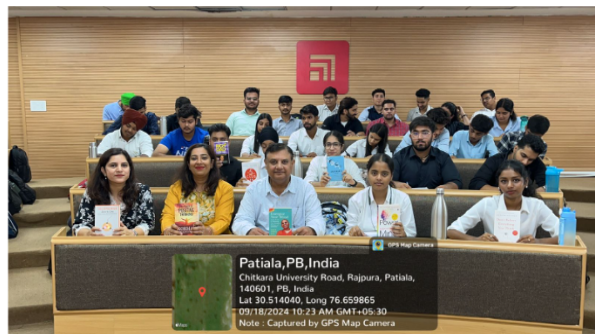
Students showcasing the books read by them in the competition ( 23-09-2024)