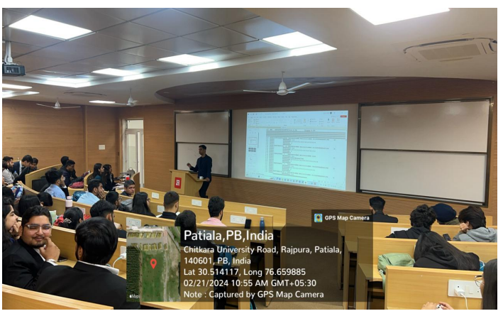
Taking doubts of Students , 21/02/2024