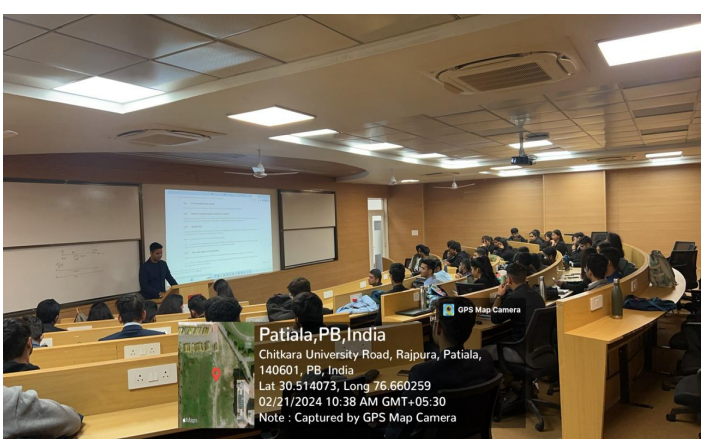
Speaker addressing the Studnets, 21/02/2024