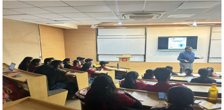
Interactive Session in Progress (25.07.2024 )