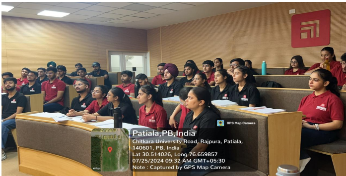
Students of IPM during the discussion (25,07,2024 )