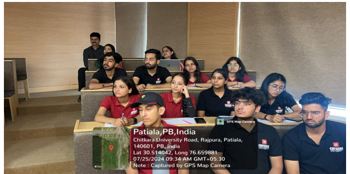
Learning Experience for students and faculty (25.07.2024 )