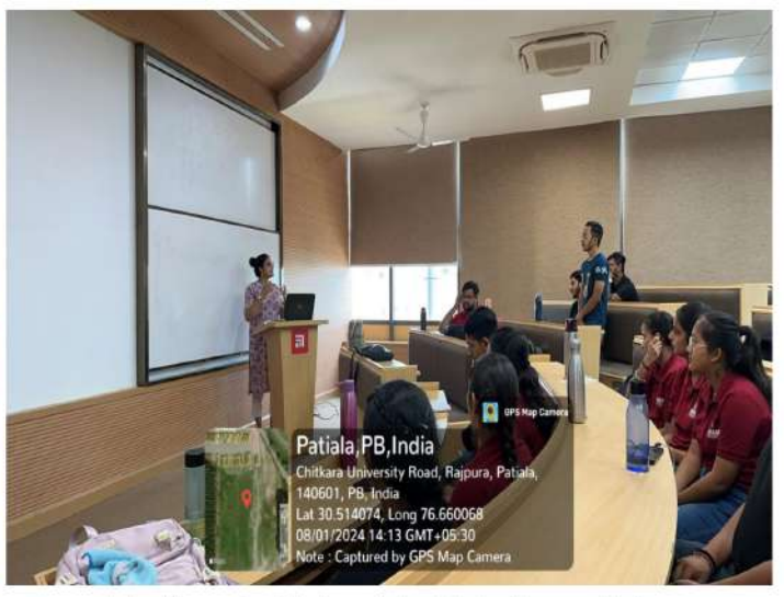
Interactive session of Under graduate students with our guest trainer