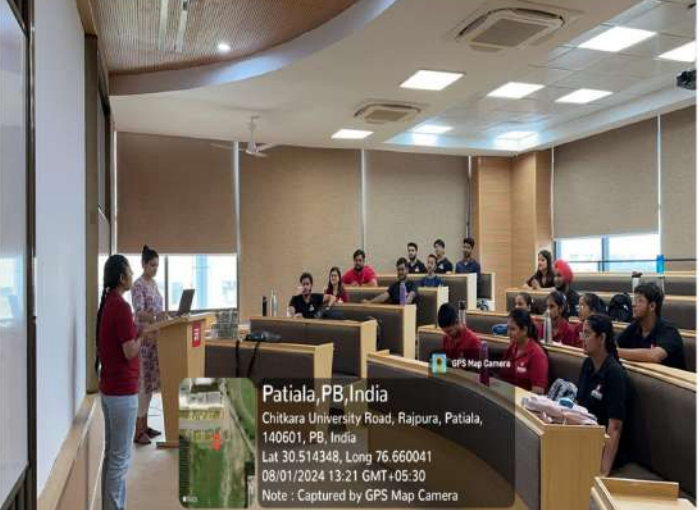
All students participating in the discussion.