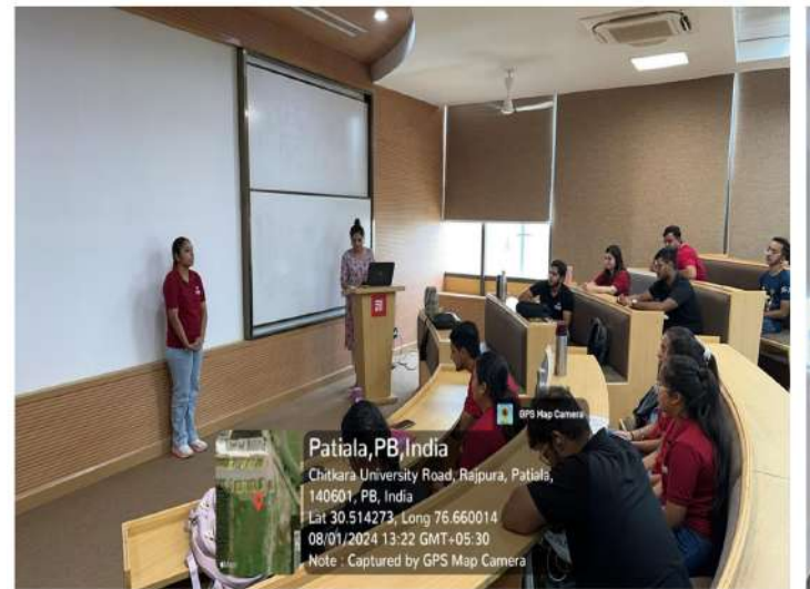
One to one interaction with the all the students by the guest trainer.