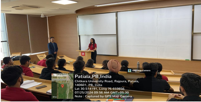
CR - BBA AVM welcoming the Trainer (25.07.2024 )