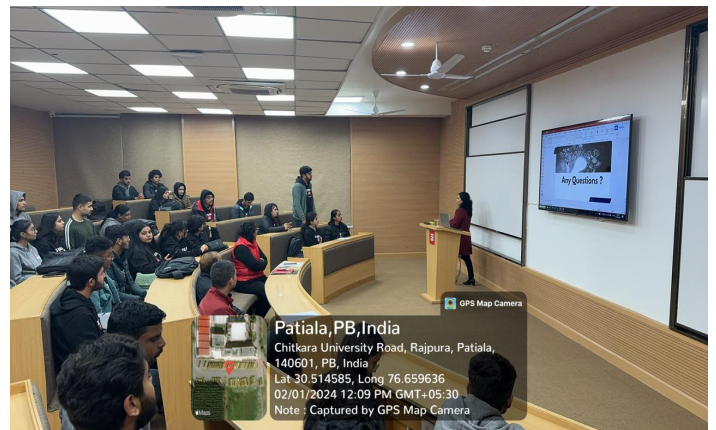
Student clearing his doubt , 01-02-2024