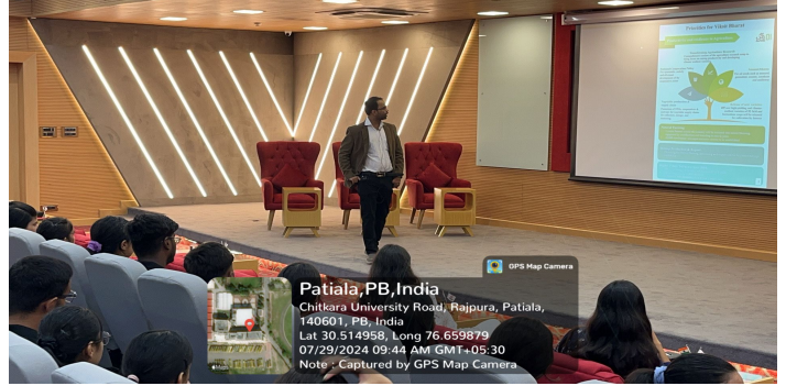
"Discussing Various areas of union Budget , 2024 "