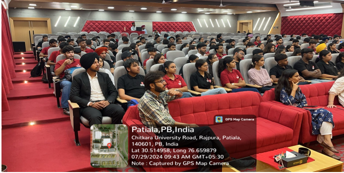
"Addressing students at the start of the session "