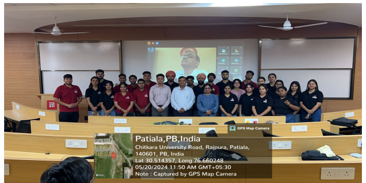
Participants and the organising Team. 20.05.2024